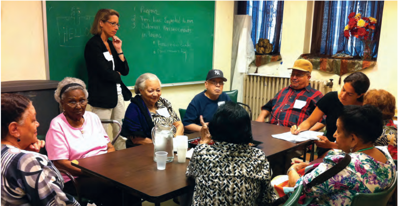
▲ Seniors who have been diagnosed with type 2 diabetes or pre-diabetes discuss ways to increase understanding about the barriers to better diabetes management during a United Hospital Fund-led focus group at the ARC Senior Center in Washington Heights, New York City.