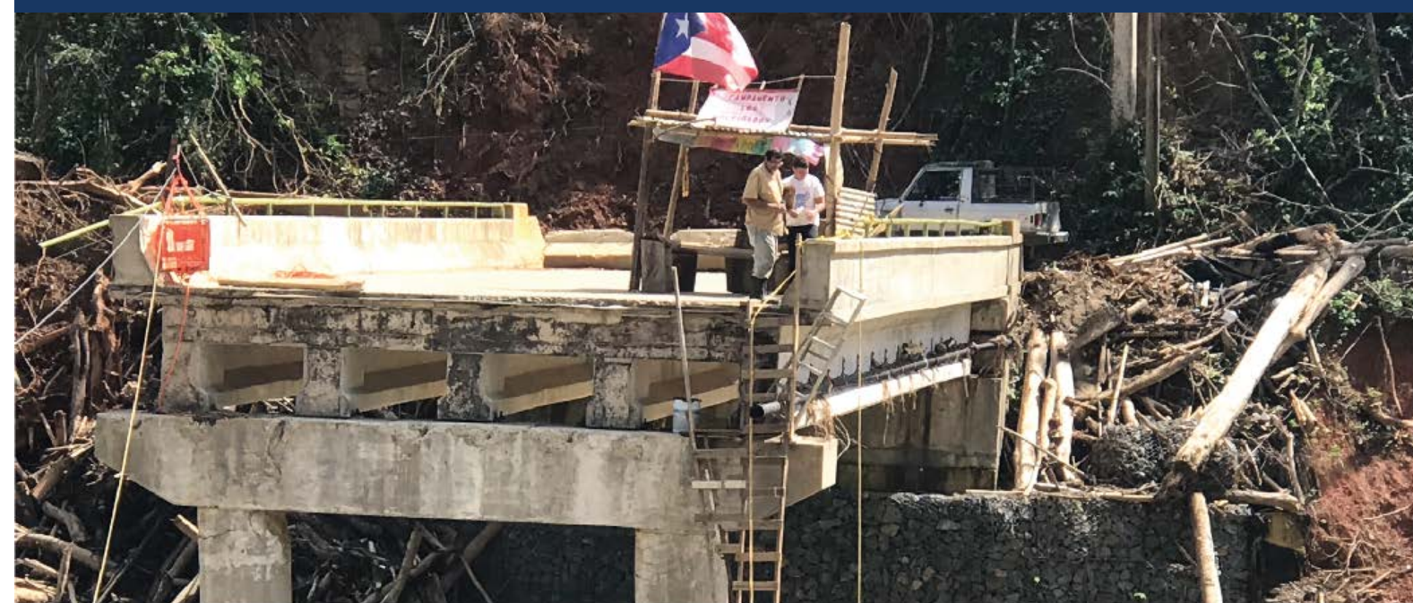
Hurricane Maria wiped away this bridge, completely cutting off a small community nestled in the mountains of Puerto Rico.

In 2017, Puerto Rico was hit by Hurricanes Irma and Maria, causing approximately 2,975 excess deaths and leaving most of the Island's infrastructure destroyed. The hurricanes strained the Puerto Rican healthcare system in ways that were unforeseen prior to the disaster, compounding and amplifying deep-seated problems. The crisis also underscored the resiliency of many communities in their fight to survive and rebuild. The CHCs served as a lifeline and became a central hub of immediate aid and continue to play a critical role in long-term recovery. Building on this role to foster the community's ability to prepare and respond to future events is critical given the population's susceptibility to hazards and impacts of climate change. The overarching goal of this project is to build capacity among health centers to employ a community mobilization framework for emergency preparedness in order to improve health outcomes of vulnerable populations before, during and after a disaster.