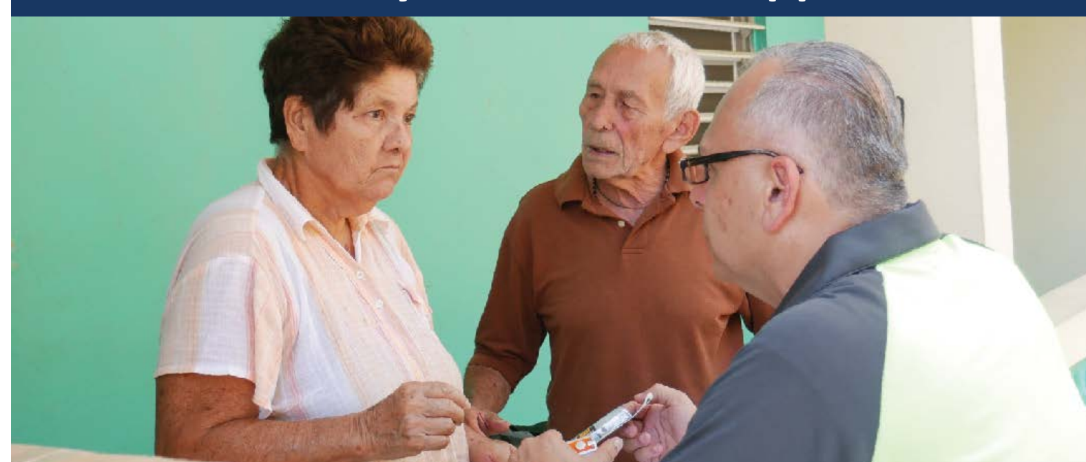
CSM went door-to-door checking on their patients after Hurricane Maria.

Community mobilization employs a cross-sectoral, community-based, participatory approach to address health, social, or environmental issues, empowering individuals and groups to take action to facilitate change, including policy change. This model has been utilized by the Centers for Disease Control and Prevention and World Health Organization to successfully tackle specific diseases or community health concerns in the US and internationally.