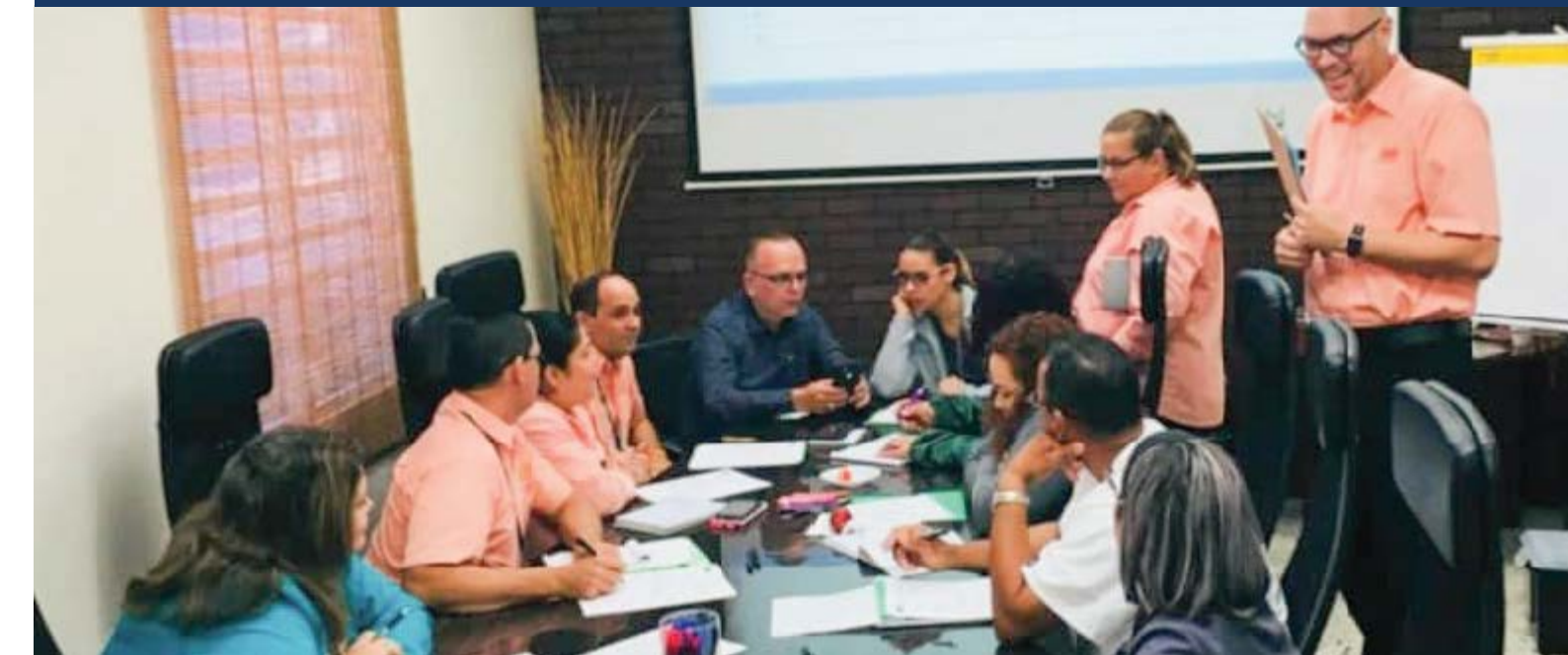
Our CSM partners discuss resource mapping as one of our project key activities.

In project year 1, MCN is partnering with two community health centers, Hospital General Castañer (HGC) and Corporación de Servicios Médicos (CSM), along with the communities they serve, to develop and pilot this initiative. HGC serves several rural, agricultural communities in the mountains of central Puerto Rico including Castañer, Adjuntas and Jayuya. CSM serves several of the island's northern towns including Hatillo, Arecibo, Utuado and Aguadilla. Many of these communities were hardest hit by Hurricane Maria. The vast majority of patients served by these health centers are Hispanic and live at or below the federal poverty line.