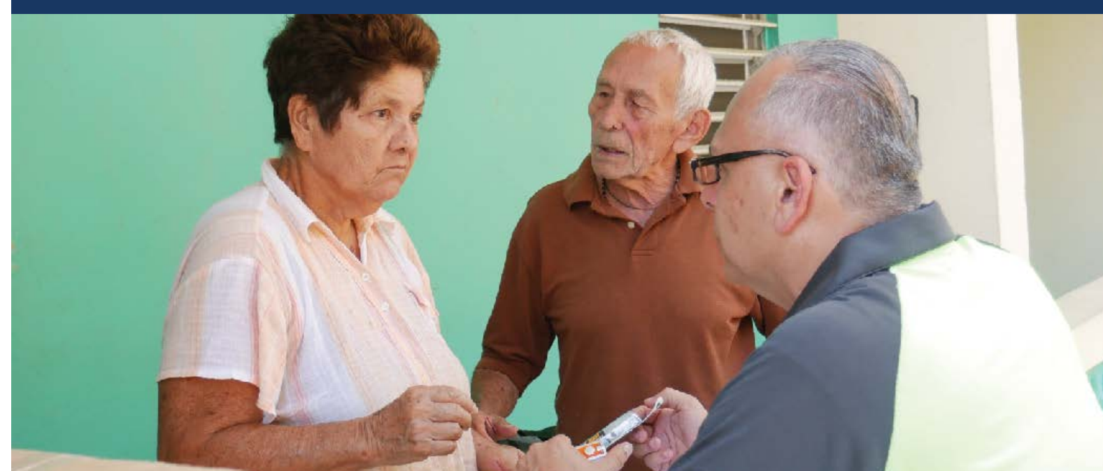
CSM went door-to-door checking on their patients after Hurricane Maria.

Community mobilization employs a cross-sectoral, community-based, participatory approach to address health, social, or environmental issues, empowering individuals and groups to take action to facilitate change, including policy change. This model has been utilized by the Centers for Disease Control and Prevention and World Health Organization to successfully tackle specific diseases or community health concerns in the US and internationally.